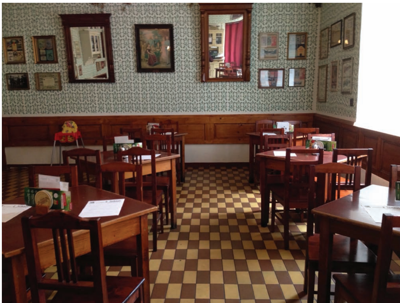
FIGURE 4: U Šumavy , “a homey, folksy hospoda.”