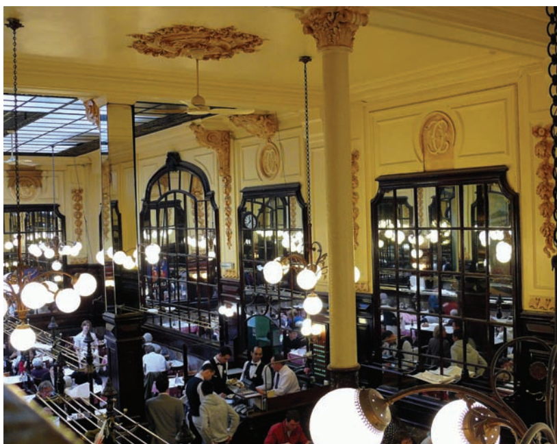
FIGURE 3: Bouillon Chartier in Paris.