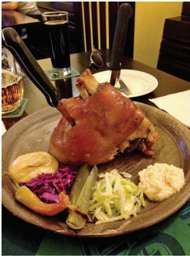
FIGURE 5: Vepřové koleno [roasted pork knee] with the traditional accompaniments of horseradish, mustard, and pickles.