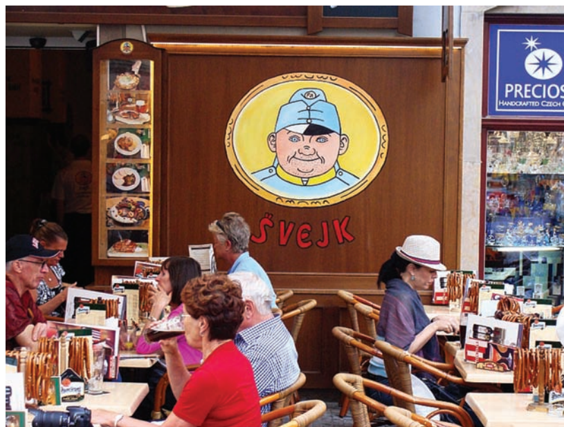
FIGURE 2: A Švejk-themed bar in Prague.

With his restaurant reviews, Král inconspicuously positioned himself to become a culinary trendsetter. The fact that he presented this project in an accessible format, publishing in the daily newspaper Lidové noviny rather than, say, a literary journal, corresponds with the way he branded himself as a non-elite gourmet. In fact, the choice of Lidové noviny , popularly called Lidovky , points to Král's historical orientation. Founded in 1893, it is the oldest Czech daily, and during the First Republic it featured the work of Masaryk, Čapek, and other original pátečníci . The paper was closed in 1952 during the most repressive period of communist rule, but enjoyed a remarkable second life in the late 1980s when it was revived in the samizdat (self-publishing) press. Dissidents such as Havel, Eva Kantůrková, and Milan Šimečka contributed to Lidovky in its new unofficial configuration. Officially reopened around the