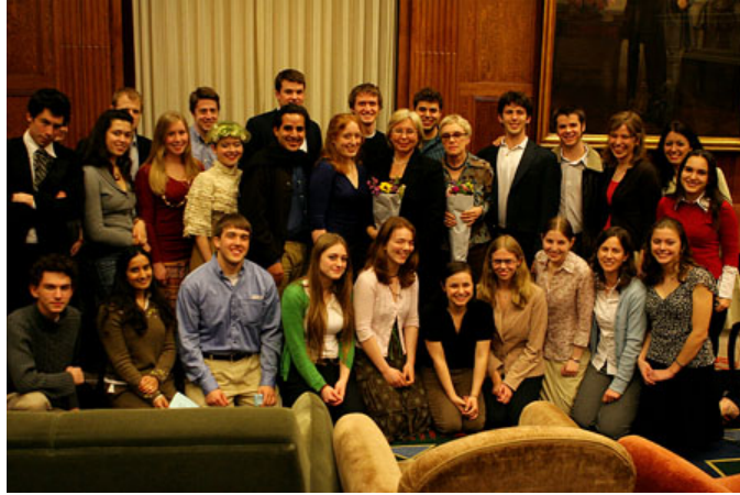
Nature in Russian Songs and Poetry Performed by the Students of the Slavic Department