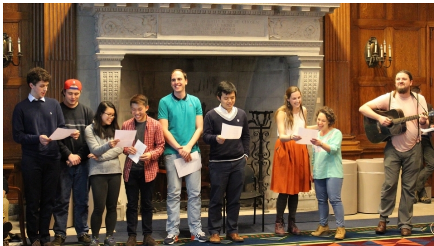
Year of Russian Cinema Festival at the Barker Center Performed by the Students of the Russian Ab class.

In the past, undergraduates in the Department have also sponsored their own activities, sometimes in conjunction with the graduate students. In recent years, for example, we have had Slavic poetry slams and mini-film festivals of Russian and East European film. Often the Davis Center for Russian and Eurasian Studies has in its budget a few hundred dollars available for undergraduate activities. This money may be used, in whole or in part, for any Slavic-oriented activity organized by undergraduates (with the stipulation that these funds not be used for refreshments). If you are interested in organizing film showings, inviting a lecturer, or organizing other events, please consult the Director about the possibility of using these funds. In addition, the Slavic Department in the recent past has organized a couple of annual events, such as a play, poetry reading, and/or musical performance, in which our concentrators and other Harvard students studying the Russian language and culture are the main participants. Late in the spring term the Davis Center, with the assistance of the Slavic Department, sponsors a Russian Studies Day, when Harvard, Wellesley, and Wheaton seniors come together to present their senior theses. Entertainment is also provided.