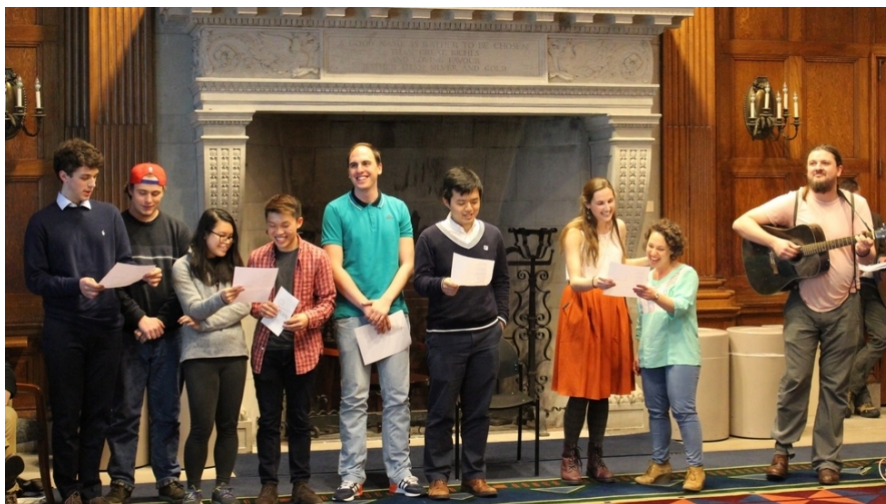
Year of Russian Cinema Festival at the Barker Center Performed by the Students of the Russian Ab class.

In the past, undergraduates in the Department have also sponsored their own activities, sometimes in conjunction with the graduate students. In recent years, for example, we have had Slavic poetry slams and mini-film festivals of Russian and East European film. Often the Davis Center for Russian and Eurasian Studies has in its budget a few hundred dollars available for undergraduate activities. This money may be used, in whole or in part, for any Slavic-oriented activity organized by undergraduates (with the stipulation that these funds not be used for refreshments). If you are interested in organizing film showings, inviting a lecturer, or organizing other events, please consult the Director about the possibility of using these funds. In addition, the Slavic Department in the recent past has organized a couple of annual events, such as a play, poetry reading, and/or musical performance, in which our concentrators and other Harvard students studying the Russian language and culture are the main participants. Late in the spring term the Davis Center, with the assistance of the Slavic Department, sponsors a Russian Studies Day, when Harvard, Wellesley, and Wheaton seniors come together to present their senior theses. Entertainment is also provided.