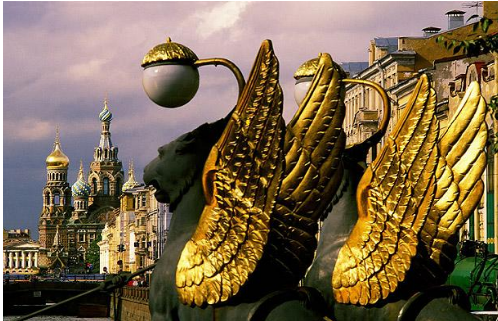
The Bank Bridge and Church of the Savior on Blood, St. Petersburg

Built in 1826, the Bank Bridge spans 25 meters across the Griboedov Canal. The bridge is well known throughout Russia for the four gilded griffin sculptures, designed by Pavel Sokolov, gracing its side. The Church of the Savior on Blood, completed in 1907, is one of the most visited sites in St. Petersburg. Built on the site of the assassination of Alexander II, tourists from all over the world have been attracted to this enchanting cathedral due to its vivid colors and architecture on both its interior and exterior.