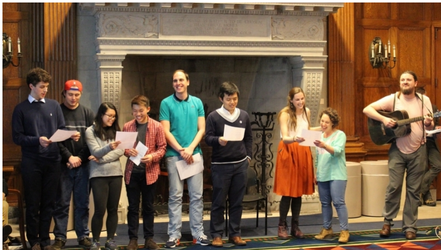
Year of Russian Cinema Festival at the Barker Center Performed by the Students of the Russian Ab class.

In the past, undergraduates in the Department have also sponsored their own activities, sometimes in conjunction with the graduate students. In recent years, for example, we have had Slavic poetry slams and mini-film festivals of Russian and East European film. Often the Davis Center for Russian and Eurasian Studies has in its budget a few hundred dollars available for undergraduate activities. This money may be used, in whole or in part, for any Slavic-oriented activity organized by undergraduates (with the stipulation that these funds not be used for refreshments). If you are interested in organizing film showings, inviting a lecturer, or organizing other events, please consult the Director about the possibility of using these funds. In addition, the Slavic Department in the recent past has organized a couple of annual events, such as a play, poetry reading, and/or musical performance, in which our concentrators and other Harvard students studying the Russian language and culture are the main participants. Late in the spring term the Davis Center, with the assistance of the Slavic Department, sponsors a Russian Studies Day, when Harvard, Wellesley, and Wheaton seniors come together to present their senior theses. Entertainment is also provided.