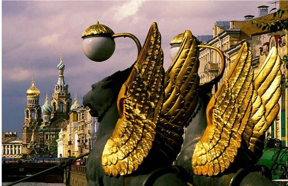
The Bank Bridge and Church of the Savior on Blood, St. Petersburg

Built in 1826, the Bank Bridge spans 25 meters across the Griboedov Canal. The bridge is well known throughout Russia for the four gilded griffin sculptures, designed by Pavel Sokolov, gracing its side. The Church of the Savior on Blood, completed in 1907, is one of the most visited sites in St. Petersburg. Built on the site of the assassination of Alexander II, tourists from all over the world have been attracted to this enchanting cathedral due to its vivid colors and architecture on both its interior and exterior.