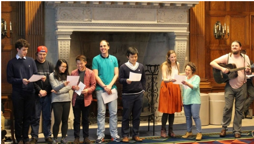
Year of Russian Cinema Festival at the Barker Center Performed by the Students of the Russian Ab class.

In the past, undergraduates in the Department have also sponsored their own activities, sometimes in conjunction with the graduate students. In recent years, for example, we have had Slavic poetry slams and mini-film festivals of Russian and East European film. Often the Davis Center for Russian and Eurasian Studies has in its budget a few hundred dollars available for undergraduate activities. This money may be used, in whole or in part, for any Slavic-oriented activity organized by undergraduates. If you are interested in organizing film showings, inviting a lecturer, or organizing other events, please consult the Director about the possibility of using these funds. In addition, the Slavic Department in the recent past has organized a couple of annual events, such as a play, poetry reading, and/or musical performance, in which our concentrators and other Harvard students studying the Russian language and culture are the main participants. Late in the spring term the Davis Center, with the assistance of the Slavic Department, sponsors a Russian Studies Day, when Harvard, Wellesley, and Wheaton seniors come together to present their senior theses. Entertainment is also provided.